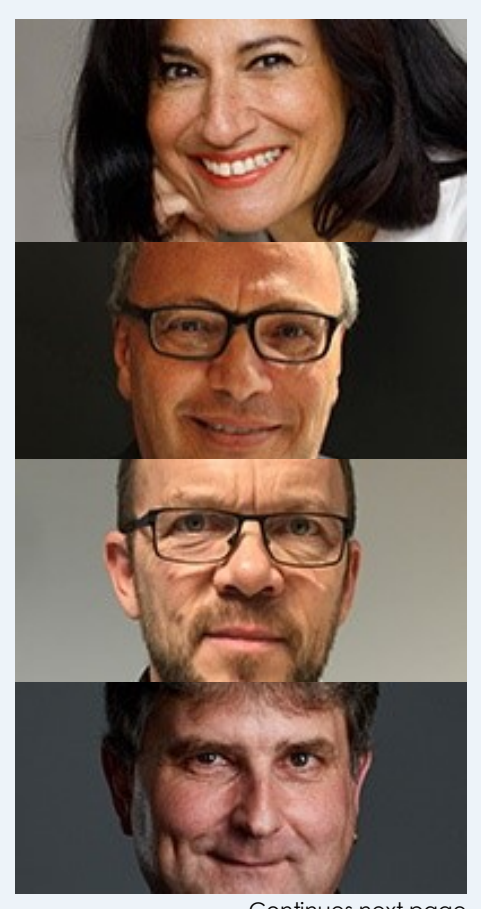
Continues next page