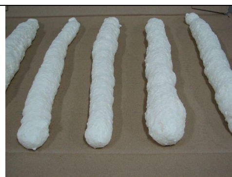
Figure 2: strings on the cardboard