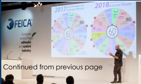
Continued from previous page

Van Hooijdonk believes that the future of logistics and transport offers solutions to many of the challenges we face today, "Technology causes acceleration in transport and logistics. In the future, self-driving systems will drive through the city like 'trains', drones will control transport from the airport and we will all have a self-driving car that effortlessly takes us from A to B. Logistics technology will have a significant impact on production chains and 3D printers will create unprecedented disruption in the supply chain."