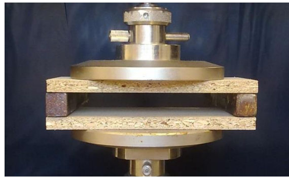
Figure 1. Set up for the measurement