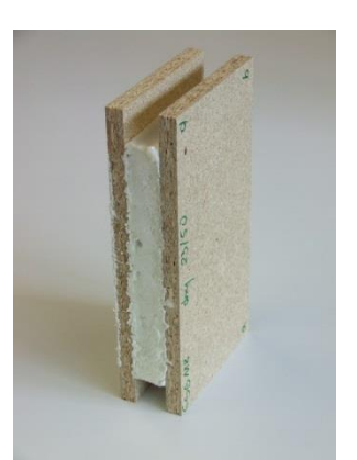
Figure 3: water drip off