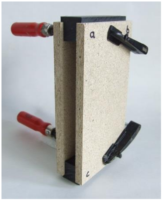
Figure 2: assembly of test plates

The spacers are placed at least 5 mm from the side of the boards to be able to put the slide rule between the boards. The clamps are used to fix the joints (positioned at each corner or in line of the spacers).