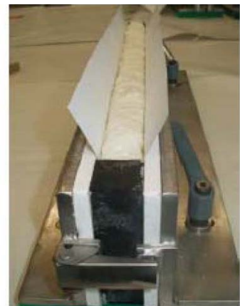
Figure 3: Joint with cured foam.