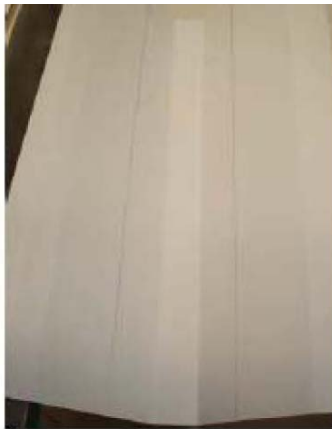
Figure 1: Typewriter paper insert with orientation lines