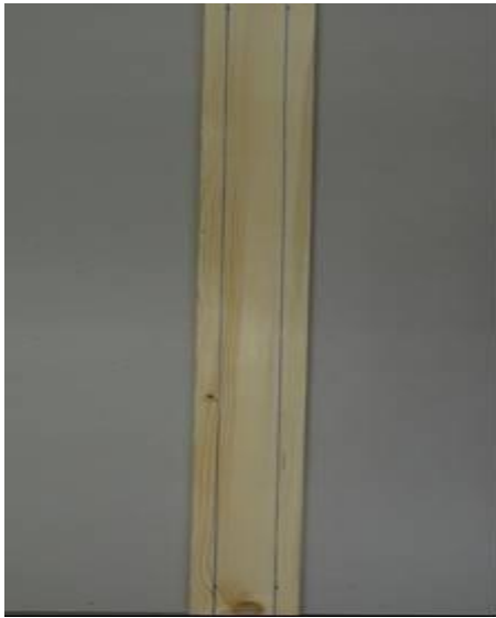
Figure 1: Marking lines at the boards