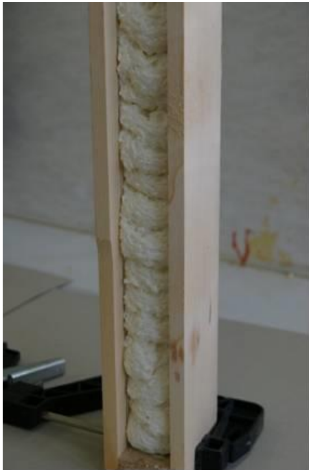
Figure 3: Filled joint