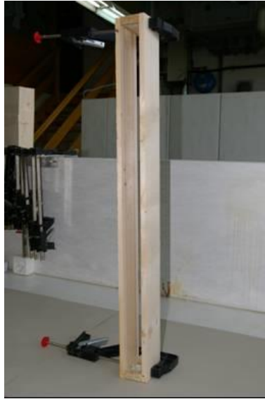
Figure 2: Vertical joint for test (empty)